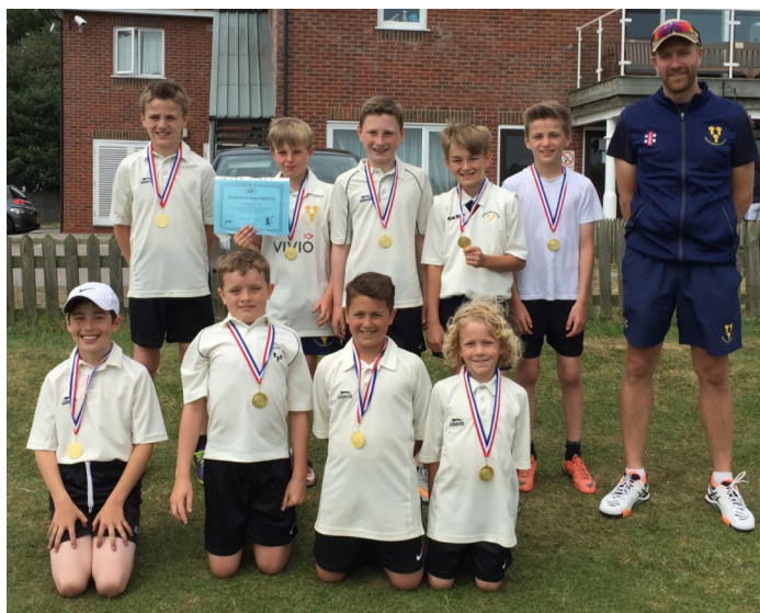
Upton Heath B Competition Winners

Congratulations to Upton Heath for winning with 247! And well done to Belgrave for finishing in second place with 231!