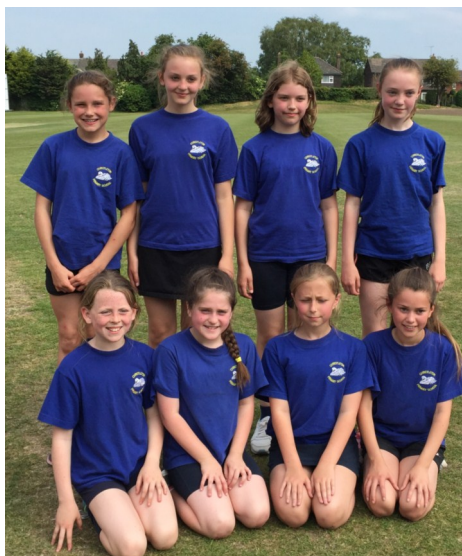
Christleton Runners up of the Kwik Cricket Girls