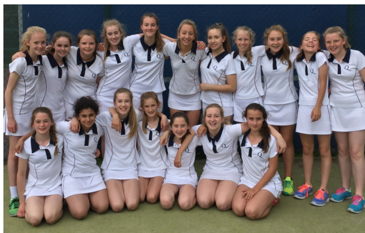
Queens School Young Tennis Leaders