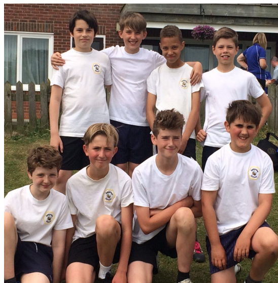
Belgrave Mixed B Kwik Cricket Competition Runners up