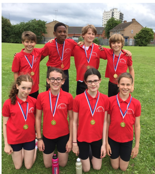
Winners– Overleigh St Mary's

Overleigh St Mary's will now go onto represent Chester in the Level 3 summer games in Warrington this July- Good luck!.