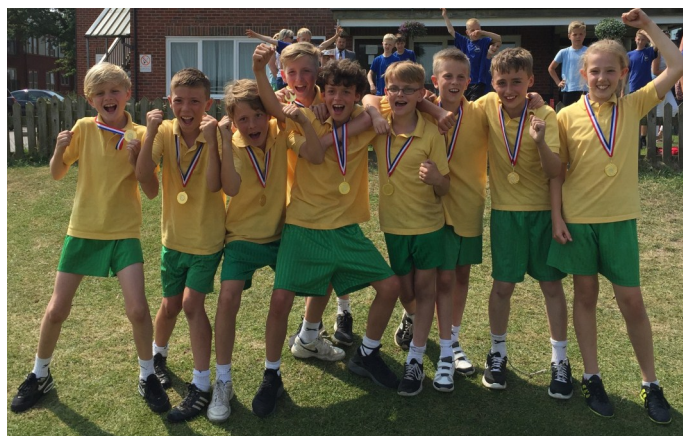
Tattenhall Mixed A competition Cup Winners

Tattenhall and Christleton will go onto represent Chester in the level 3 finals at Warrington Cricket Club on the 8 th July– Good luck!