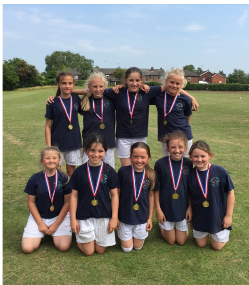
Saughall Girls Competition Winners