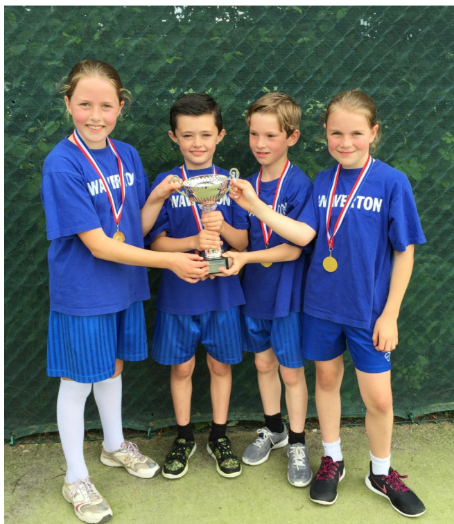
Waverton Year 3&4 Mini Red Tennis Winners

Many thanks to The Queen's School leaders, the 18 young tennis leaders recently completed a tennis leaders course which enabled them to qualify to lead a great event ! Thank you also to Glan Aber tennis club for allowing us to use such a great facility which provided a great experience for all!