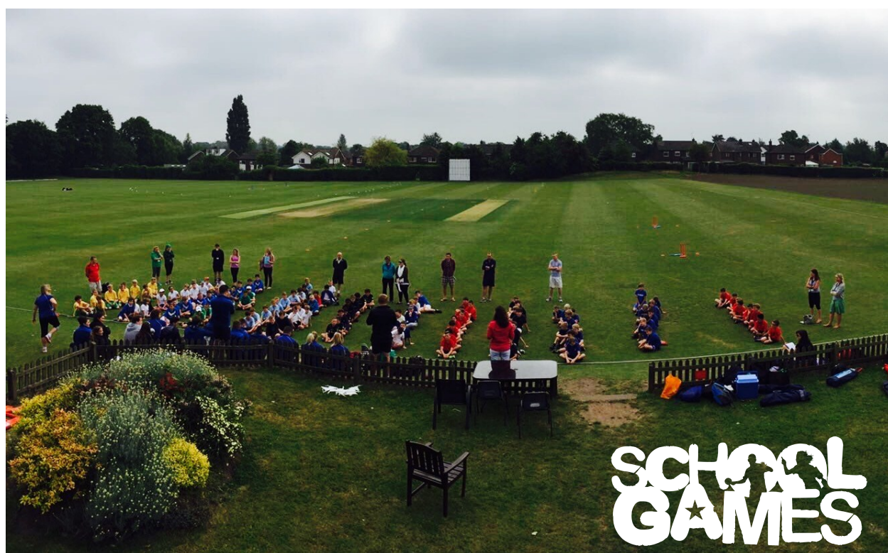
Opening of the Kwik Cricket