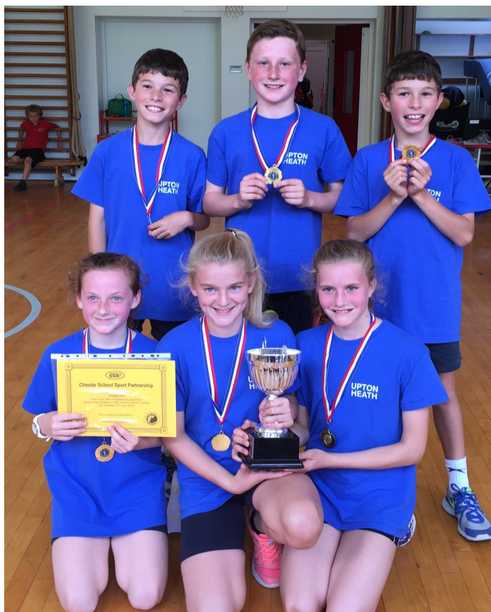
Upton Heath Year 5/6 Orienteering Winners

Upton Heath will now go onto represent Chester in the Summer Games Orienteering taking place in Warrington.