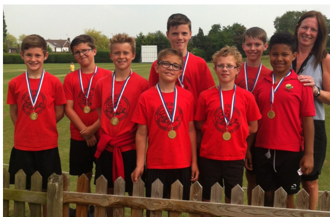
Guilden Sutton Plate Winners