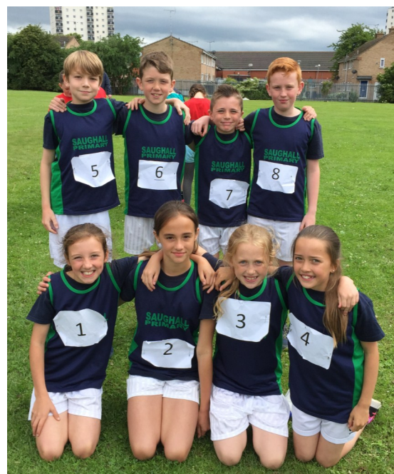
Runners up– Saughall