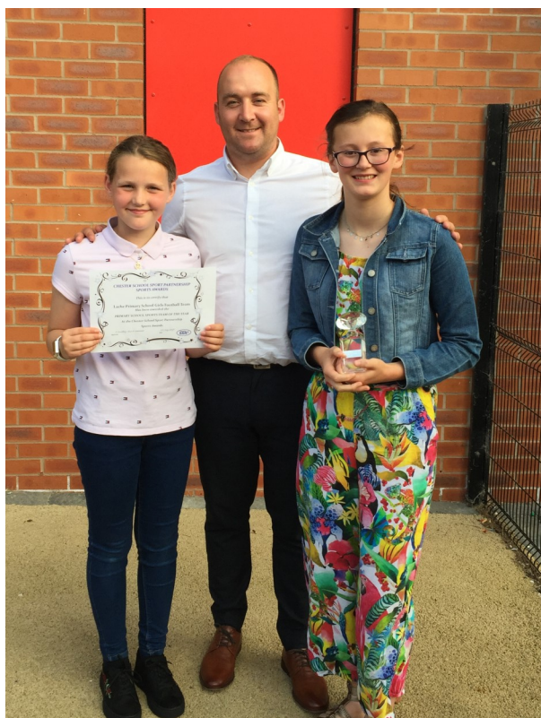
Lache Girls Football Team—Primary Sports Team of the Year.