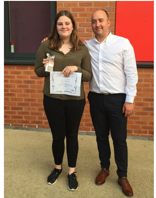
Tarporley equestrian team— Secondary Team of the Year.